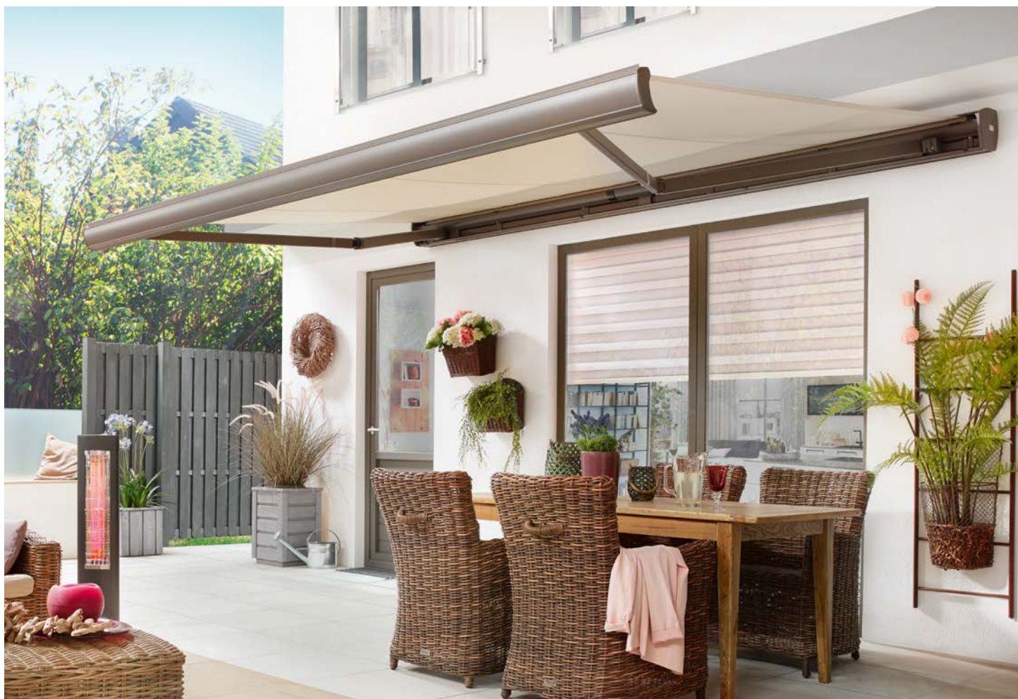
Compact design with a high degree of comfort and superb technical features.

Classic design, superior quality, ease of operation and high value retention: the Family Compact combines the protective function of a cassette awning with the ease of installation of a back bar awning.